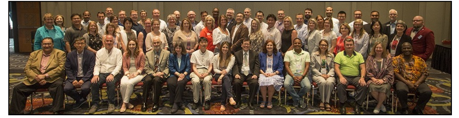
IAFP Affiliate Council Meeting, July 8, 2018.

6. Representatives from Brazil, Carolinas, New Zealand, Quebec and UAE: Many international IAFP Members are already involved in the Affiliate. Encourage Affiliate members to come to the IAFP Annual Meeting. Go outside the core incentives for non-active Affiliate Members to become more involved, i.e., target service providers, technology companies, chemical companies, and others who need to understand food safety. Offer group memberships or a free mem-